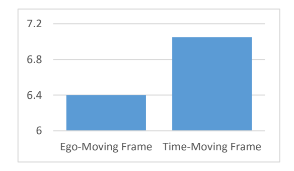
Figure 2: Framing and support for the acquisition

condition, and 2) his/her self-reported internal locus of control. The findings are robust across